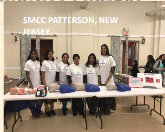
SMCC PATTERSON, NEW JERSEY