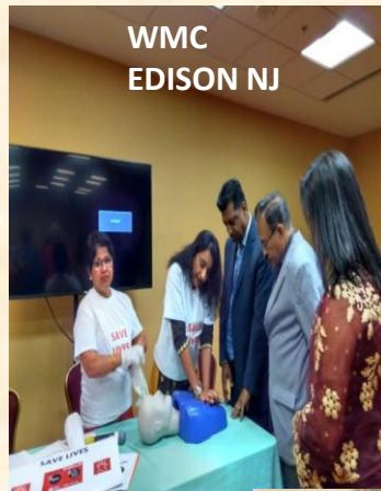
WMC EDISON NJ