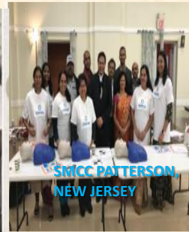
SMCC PATTERSON, NEW JERSEY