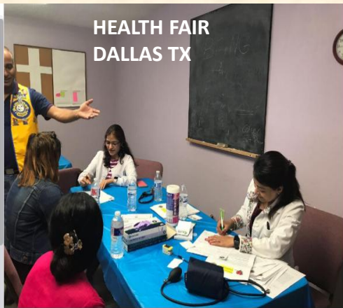
HEALTH FAIR DALLAS TX